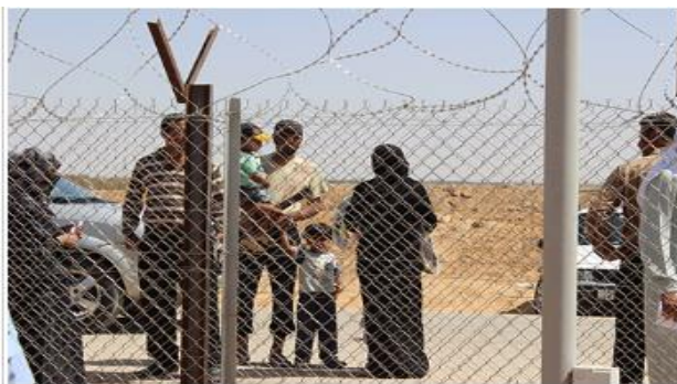
Syrian Refugees in Jordan

improving transport logistics within the greater Levant, and liberalizing intra-Levant trade in services. The indirect effect is important to consider because the war put an end to plans for deepening intra-regional trade ties as envisioned by the "Levant Quartet" agreement in 2010. The benefits of deep trade integration reforms, especially the liberalization of services trade, were expected to be sizable, reflecting significant economic complementarities among the six Levant countries and possibilities to generate productivity gains and attract foreign investments (World Bank, 2014). 2