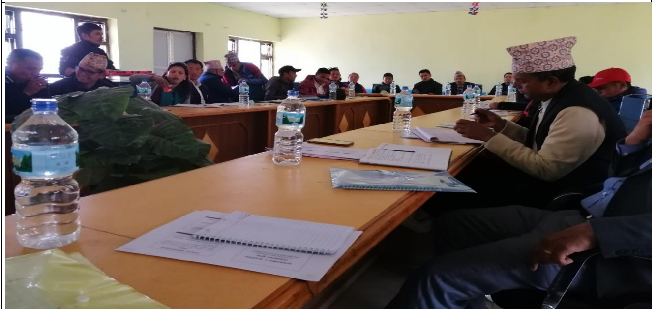
Stakeholders' Consultation Meeting, Khotang