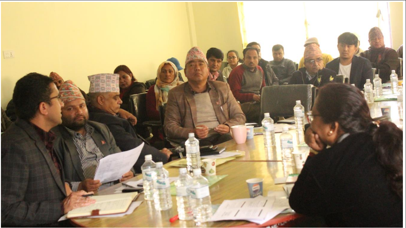
Participants providing their feedbacks on ESMF, Syangja