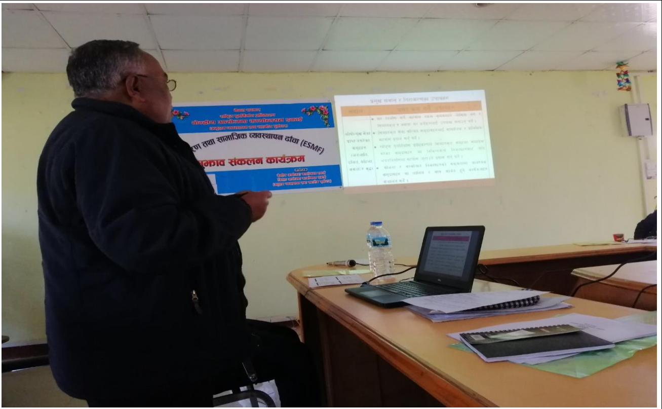
CLPIU, GMaLI Representative Presenting ESMF, Khotang