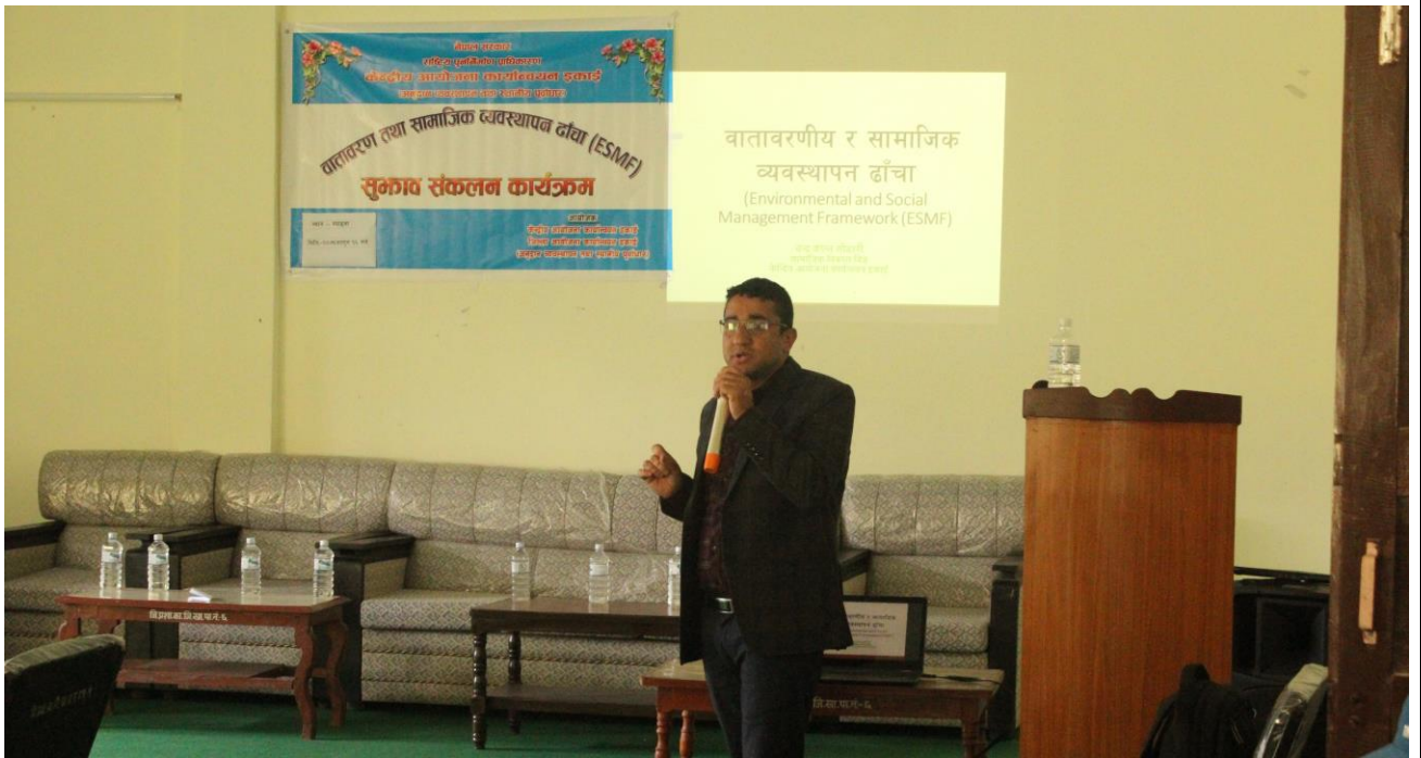
CLPIU, GMaLI Representative Presenting ESMF, Syangja