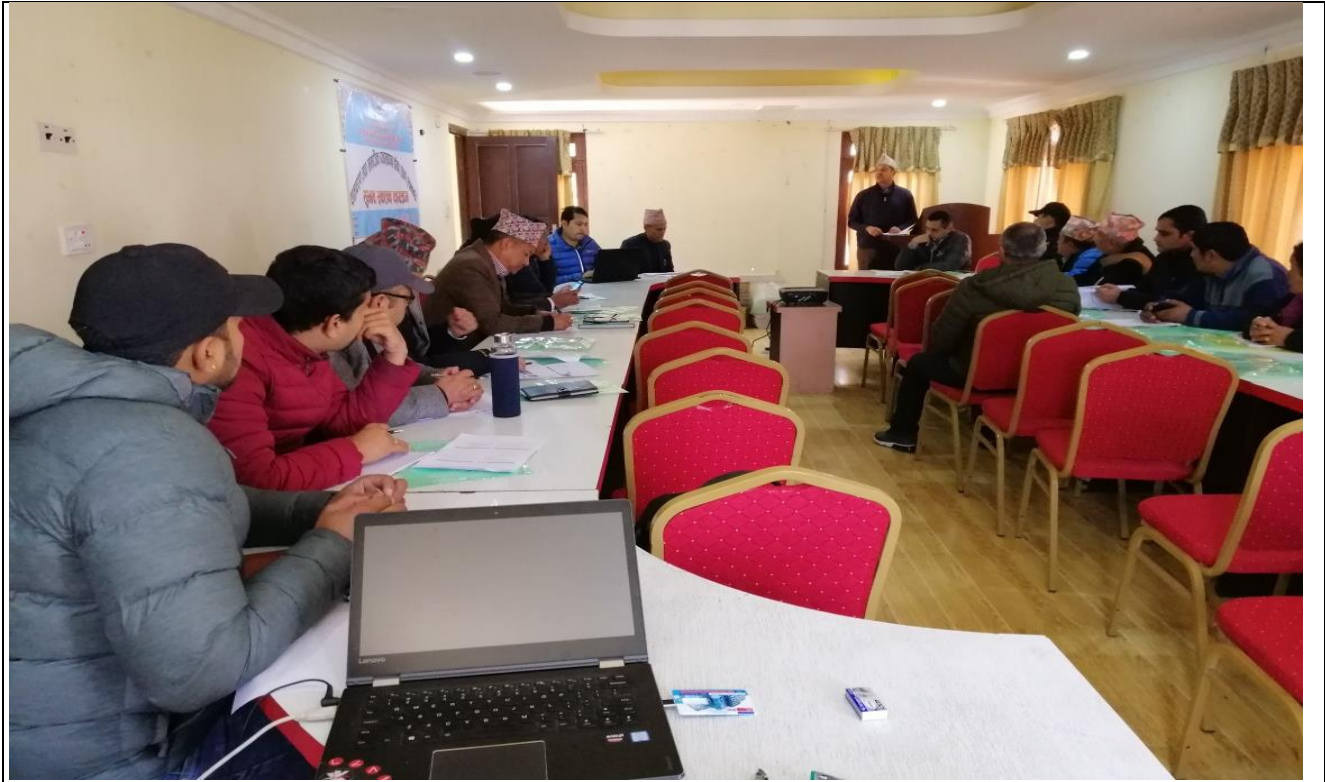
Deputy Project Director, CLPIU GMaLI breafing on EHRP and ESMF, Lamjung