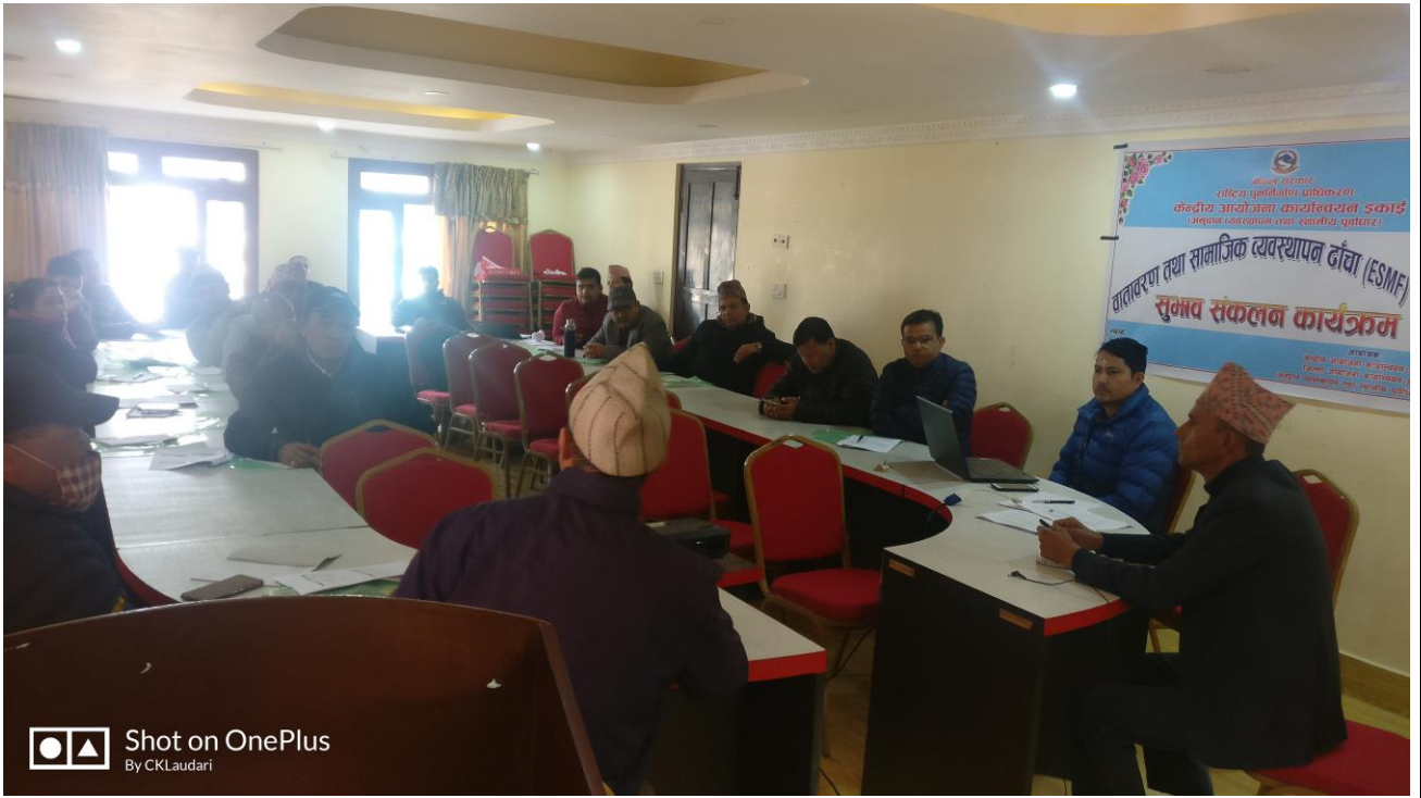
District Level Officials and Beneficiaries, Lamjung