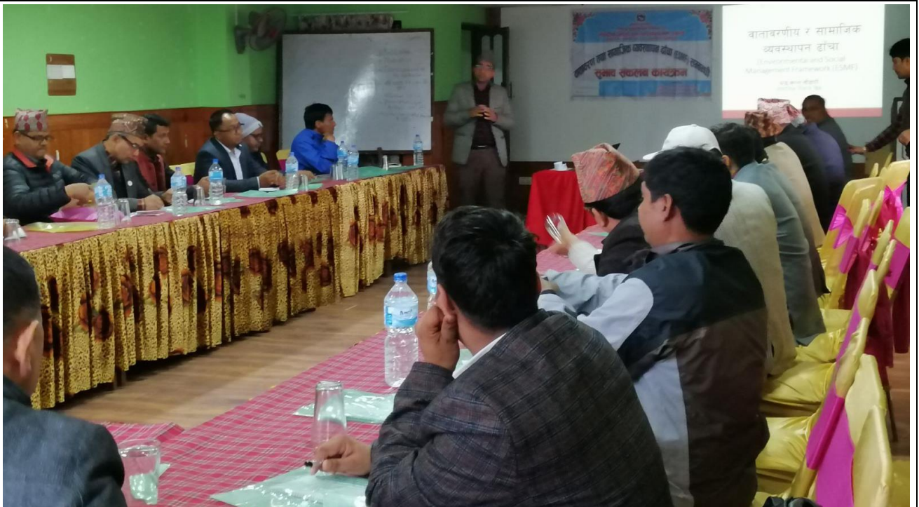
CLPIU, GMaLI Representative Presenting ESMF, Makawanpur