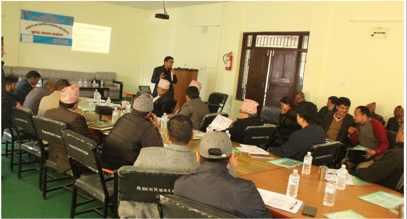
Stakeholders' Consultation Meeting, Syangja