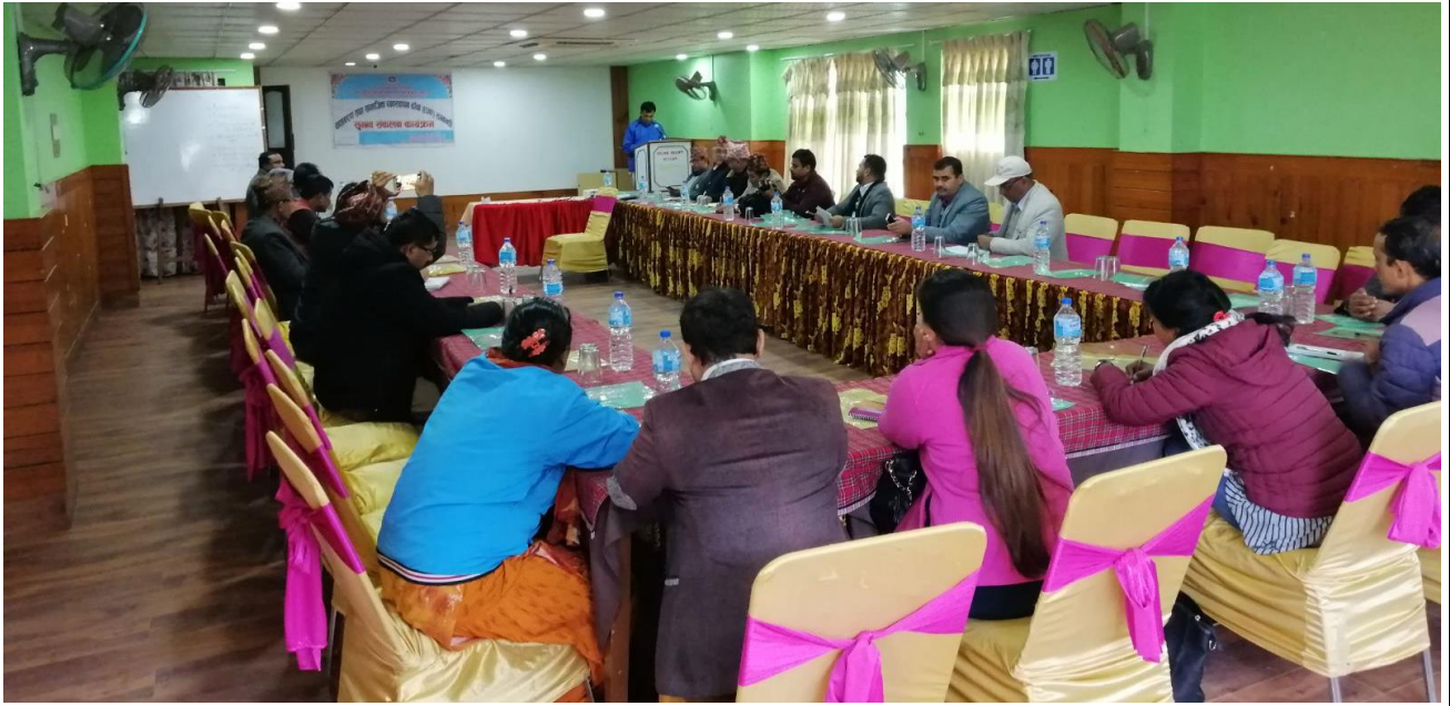
Deputy Project Director, PMU briefing on EHRP and ESMF, Makawanpur