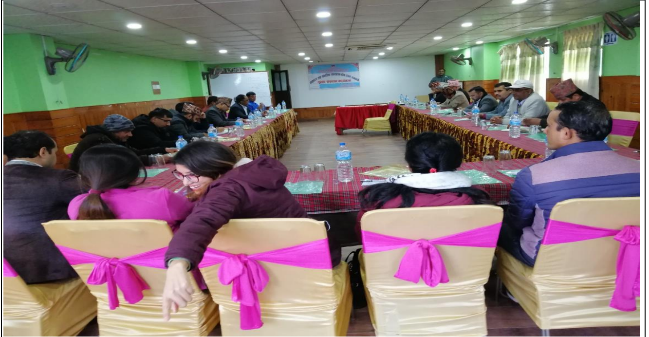
Stakeholders' Consultation Meeting, Makawanpur