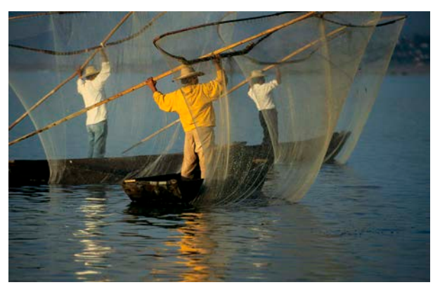
Local fisherman in Mexico.

Interest rate risk disproportionately affects developing countries, which often have limited financial capacity to bear this risk. As part of their debt management