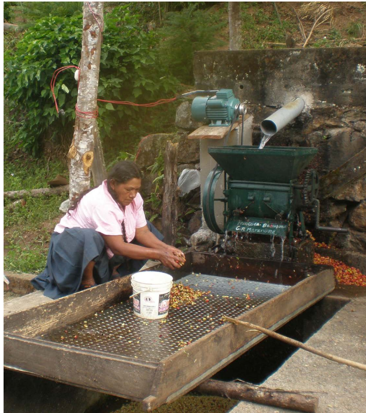
Figure 3. Coffee processing with the aid of electricity

About a third of the producers that benefited from the productive uses promotion were women. This came about naturally, as women entrepreneurs are active in bakeries, dairy production, ceramics, and textiles and are represented in most other types of productive activities in Peru.