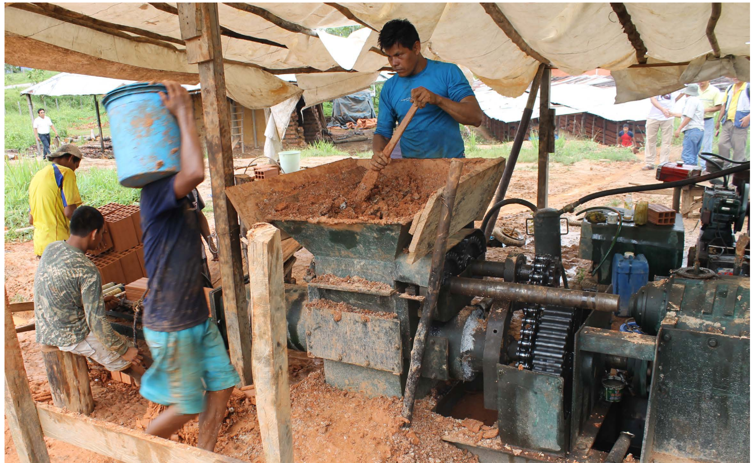
Figure 4. Power-assisted brick making

The activities targeted were chiefly small-scale operations in agriculture (e.g., coffee, cacao, grains, cereals, fruits, livestock, dairy); and off-farm activities (e.g., artisanal mining, textiles, carpentry, metal working, bakeries, ceramics, transportation, and distribution). Throughout the country, a total of 600 interventions increased electricity demand by 22.3 GWh per year, exceeding the target of 19.5 GWh.