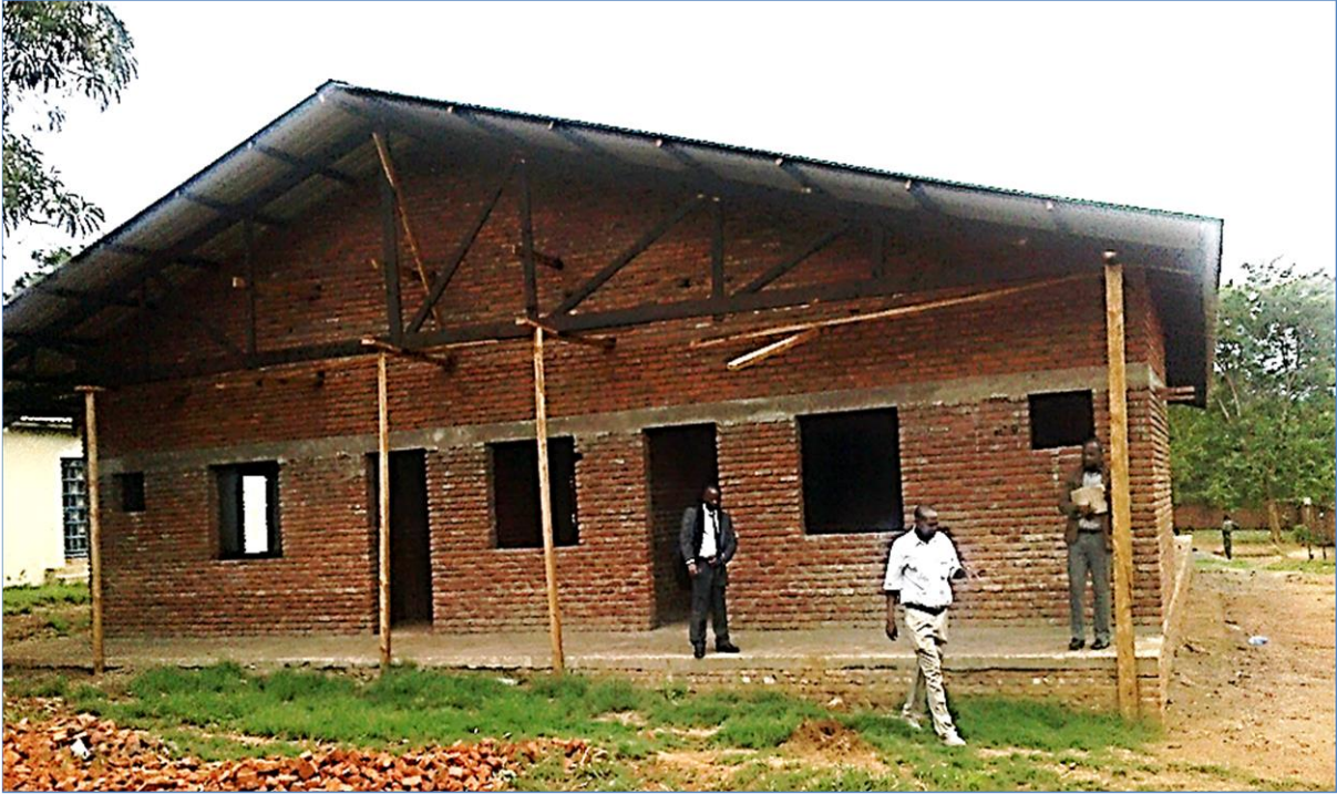
Figure A7.2: The Ebola facility under construction at Kamuzu Central Hospital