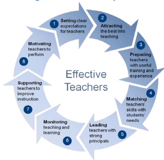
Figure 1: 8 Teacher Policy Goals

The 8 Teacher Policy Goals are functions that all high-performing education systems fulfill to a certain extent in order to ensure that every classroom has a motivated, supported, and competent teacher. These goals were identified through a review of evidence of research studies on teacher policies, and the analysis of policies of top-performing and rapidly-improving education systems. Three criteria were used to identify them: teacher policy goals had to be (i) linked to student performance through empirical evidence, (ii) a priority for resource allocation, and (iii) actionable, that is, actions governments can take to improve education policy. The eight teacher policy goals exclude other objectives that countries might want to pursue to increase the effectiveness of their teachers, but on which there is to date insufficient empirical evidence to make specific policy recommendations.