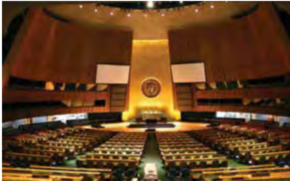
United Nations General Assembly Hall (New York)

The Guidebook presents the legal context of corruption and its consequences. It describes examples of irregularities which may occur in B2B and B2G contacts and provides advice on how an entrepreneur should behave in a corrupt situation. The Bureau draws the reader's attention to an anti-corruption policy in an enterprise, measures to limit corruption in business and specifies legal and institutional capacities to prosecute this offence.