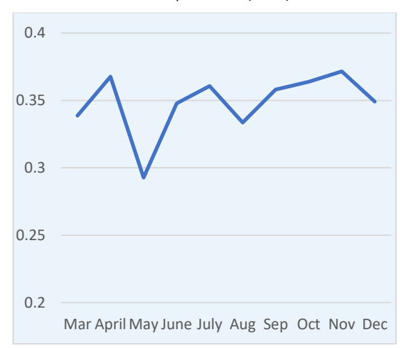
Figure 3. Share of Respondents Experiencing Food Deprivations (2019)