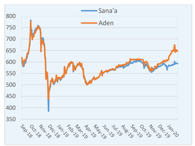
Figure 1. Parallel Market Exchange Rates (Daily Average, YR/US$)