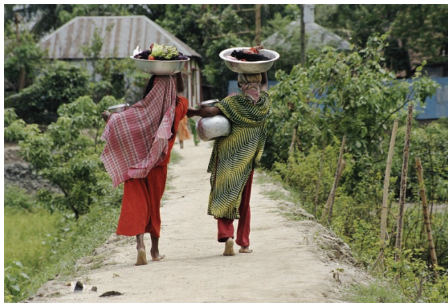
Photo 6: Women Returning Home from Market with Purchases in Bangladesh