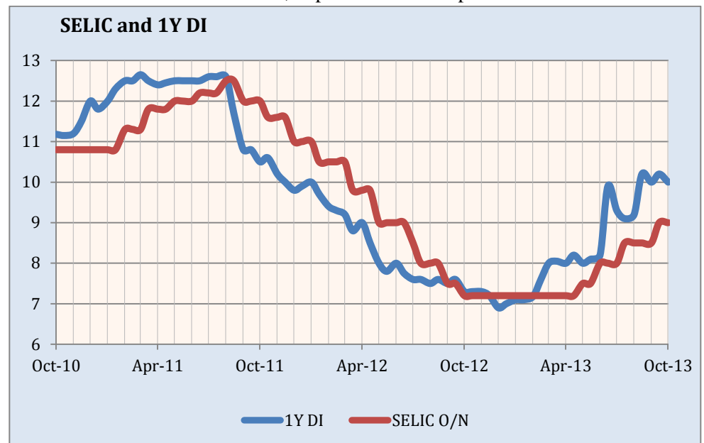
Figure 1. Brazil: Short-term interest rates, September 2010-September 2013<sup>a</sup>

<sup>a</sup> DI funds are indexed to one year CDI. Selic is the overnight rate targeted by the Central Bank for monetary policy purposes.