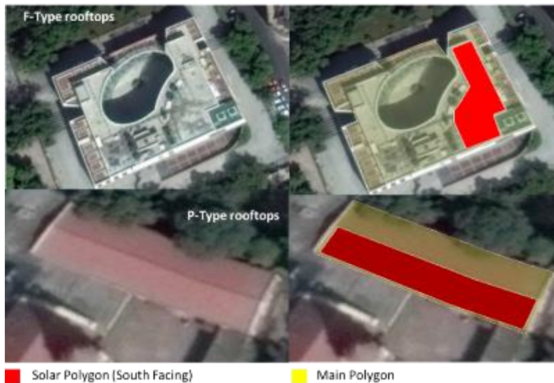
Figure 1: Main and solar polygons

The ratio of the main polygon area and solar polygon area was determined for all 909 polygons. To determine the representative multiplication factor for each building type (e.g., public, commercial), a weighted average was used. These multiplication factors were applied to building data to determine the usable roof area. Based on this methodology, the total usable area for RSPV installations in Turkey was estimated at 1.1 billion square meters (m 2 ).