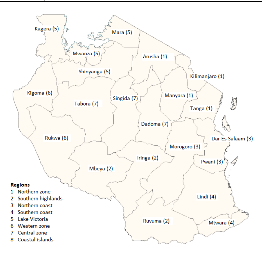
Figure A1: Agro-climatic regions of Tanzania