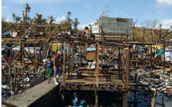
Tacloban, Philippines, after Typhoon Haiyan in November 2013.

In 2013, the Philippines experienced two major natural disasters – a magnitude 7.2 earthquake, and the Category 5 Typhoon Haiyan, which damaged several major culturally significant structures. With the assistance of the World Bank, the Department of Tourism, Philippine cultural agencies, such as the National Commission for Culture and Arts and the National Museum, and the Intramuros Administration took on a multi-hazard vulnerability assessment of the existing and damaged cultural heritage.