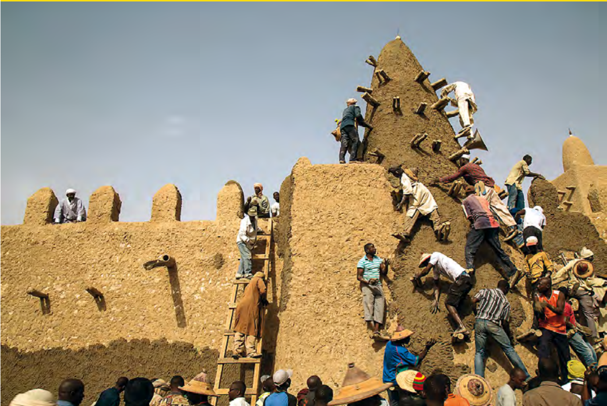
The recovery of Timbuktu, Mali.

In the case of Timbuktu, local communities were actively engaged in the reconstruction and recovery process from planning to implementation. After the 2012 conflict, development partners undertook concerted actions to safeguard cultural heritage assets in Mali. This process included not only local and international experts, but also cultural site managers and Timbuktu's local communities. The reconstruction works undertaken on the thirteen destroyed mausoleums, as well as the restoration of the damaged minaret and reinforcement of the surrounding wall of the Djingareyber Mosque, were assigned to local masons rather than to construction companies. Timbuktu's communities were actively involved in these works, guided by the local mason corporation. The collective plastering works, which had been discontinued in 2012 because of the conflict, contributed to the (re)building of social cohesion and unity and constituted a strong symbol of regained peace. Moreover, a re-sacralization ceremony allowed the families to retake possession of their mausoleums. Calling the divine mercy to maintain