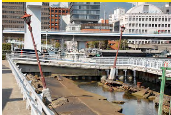
Hanshin earthquake memorial, Kobe, Japan.

A good example of a hybrid management structure is the reconstruction experience of the City of Kobe and the urban corridor of southern Hyogo Prefecture along Osaka Bay following the 1995 earthquake in Japan. To manage the recovery process, the national government established a restoration headquarters under the prime minister's office that included various cabinet ministers. Each ministry had a role in funding and policy execution and the headquarters maintained an oversight function. However, implementation of the policies was decentralized to local governments. Furthermore, a national advisory council was established that included city-planners, scholars, the business community, the mayor of Kobe, and the governor of the Hyogo Prefecture. At the local level, the City of Kobe established an earthquake recovery headquarters under the mayor's supervision as well as a 27-member recovery planning committee that included officials and academics from different disciplines. This structure evolved over the planning process as the city established an earthquake restoration planning council composed of 100 selected stakeholders and academics. This group translated the vision and guidelines into a draft recovery plan. 52