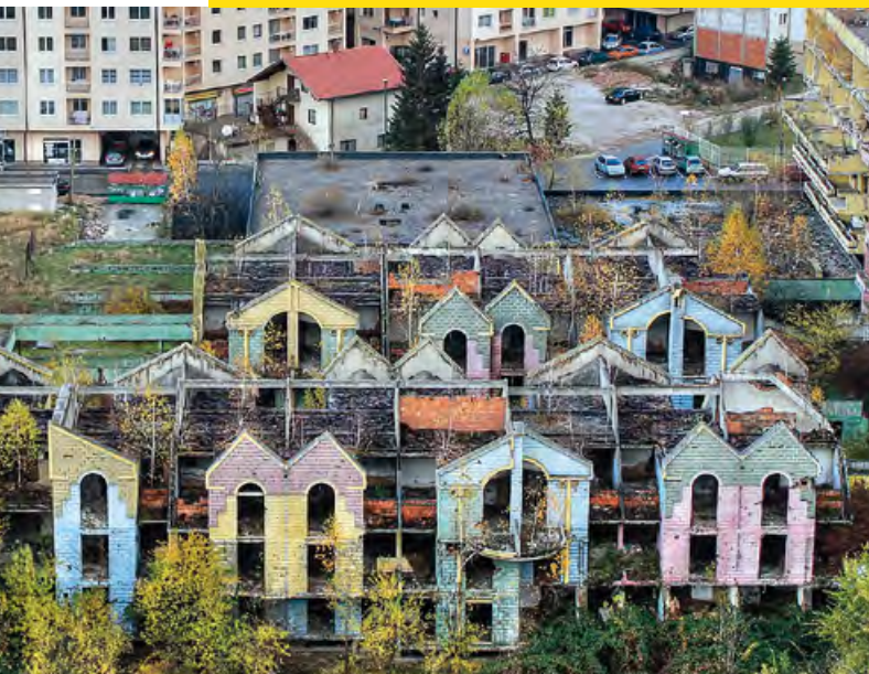
Building destroyed during the 1992–1995 civil war, Sarajevo, Bosnia and Herzegovina.

After the Bosnian war ended, Sarajevo's first step was to draft a recovery and development strategy within a period of six months. As is the case with many visioning exercises, this process was an invitation to the international community to assist in defining a development strategy for Sarajevo. The visioning process included an analysis of applicable market laws, municipal management development, and proposed transitions of the economic system. The process also analyzed relationships between economic enterprises, secured financing for city functions, established land markets, zoned business premises, city property management system, foreign capital investment, and the interests of public companies.