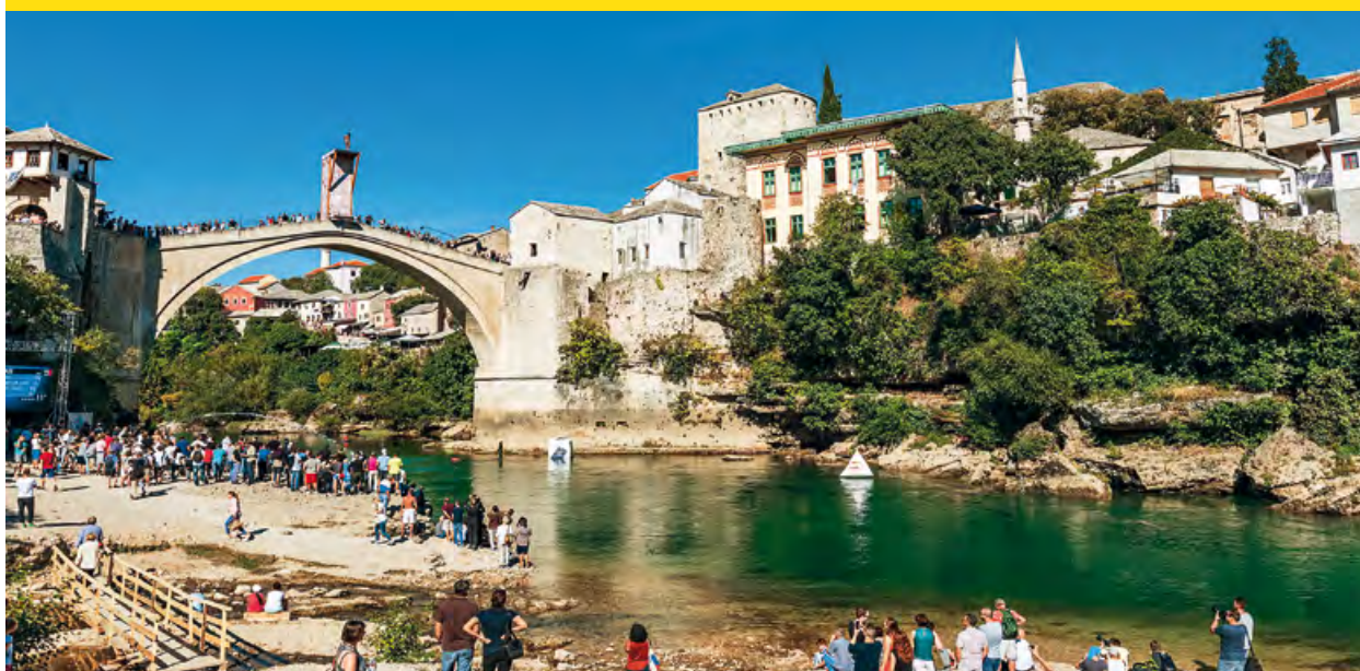
View of Stari Most Bridge and Mostar old town, Mostar, Bosnia and Herzegovina.

For Mostar's citizens, the Mostar Bridge was a cultural icon that defined the city's identity. When the bridge was destroyed in 1993 during the Bosnian War, local inhabitants prioritized reconstruction of the bridge over housing, indicating its true value to the community. The people of Mostar demanded "a full rebuilding of the bridge on the spot where it stood, in the form it had, and from the same materials as originally used.