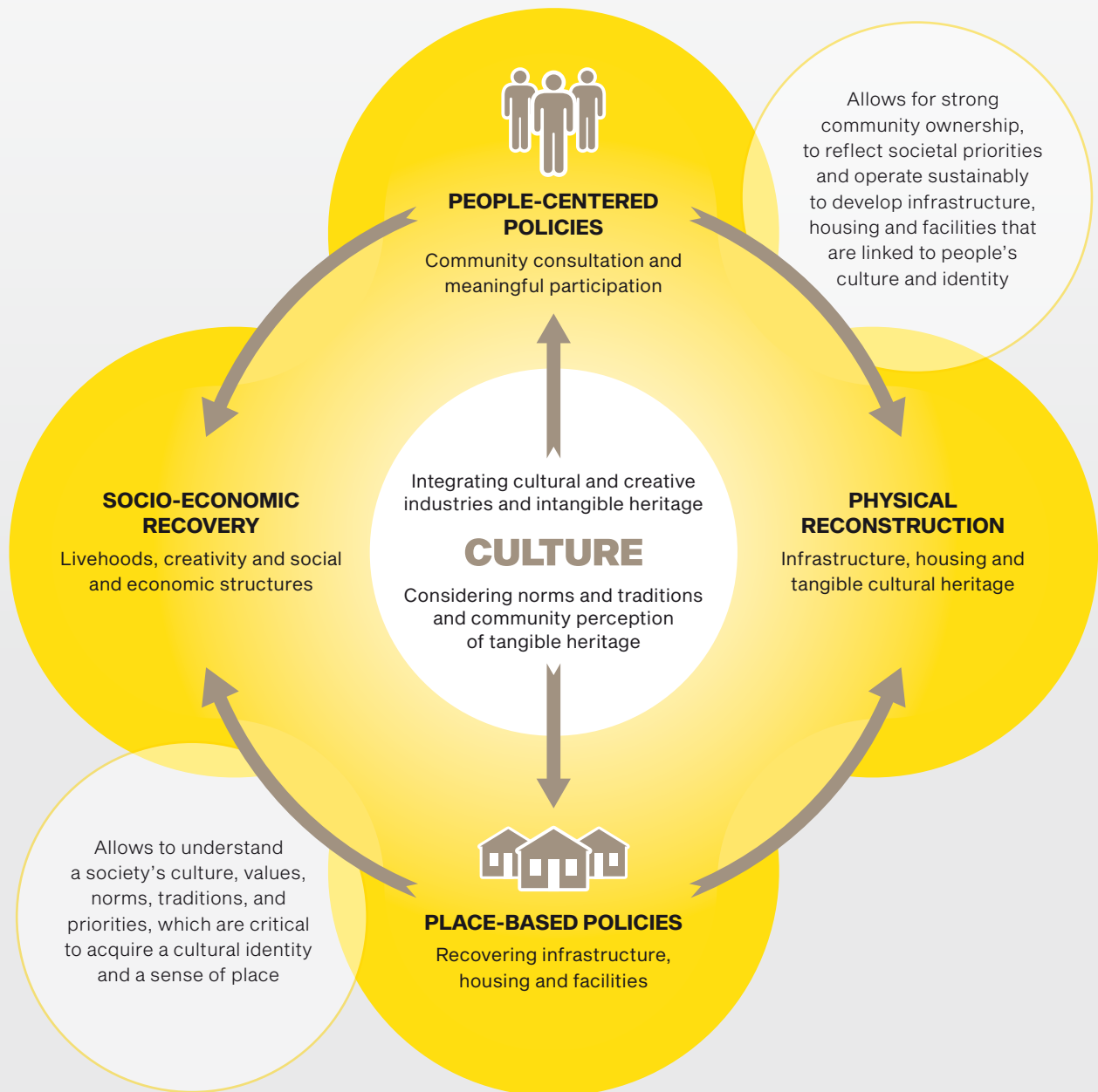
Figure 1. Culture in City Reconstruction and Recovery Framework