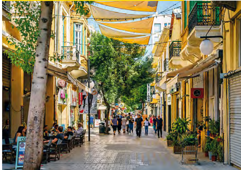
Ledra Street, Old City of Nicosia, Cyprus.

An evolving strategy implemented in the divided city of Nicosia, Cyprus, sought to promote reconciliation through the preservation of immovable cultural heritage. After the conflict in 1974, one of the first positive contacts between the two communities revolved around the preservation of their shared cultural heritage within the Old Walled City of Nicosia. Decades of experience implementing projects which initially sought only to safeguard heritage morphed into a strategy that actively preserves the shared collective memory of the city and seeks social recovery within the urban fabric. Rehabilitation of heritage buildings adjacent to the UN protected buffer zone has brought families and businesses back into neighborhoods that were devastated and abandoned because of the conflict. The historic buildings along Ledra Street, the main commercial avenue that physically links the two sides of Nicosia, were rehabilitated resurrecting it as a bustling business area, albeit separated by checkpoints. The results of these efforts are the re-establishment of social networks in what was once a war zone and the preservation of tentative linkages between communities.