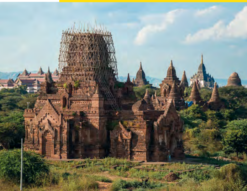
View of old pagoda in Bagan, Myanmar, still under reconstruction after the 2016 earthquake. © Boyloso/Shutterstock.com*

Following the 2016 earthquake in Myanmar, UNESCO and the World Bank along with other partners supported the government recovery efforts led by the Department of Archeology and National Museums of the Ministry of Religious Affairs and Culture. The Bagan Disaster Risk Management Plan, the first plan of its kind in Myanmar, developed with the support of the World Bank and the Government of Japan, helps to better understand the risks faced by the city of Bagan, integrate relevant management frameworks, and apply current Disaster Risk Management (DRM) measures. The development of the plan brought together many stakeholders ranging from government ministries, sub-national agencies, international and national experts, local communities, and the private sector for the management and protection of Bagan going forward.