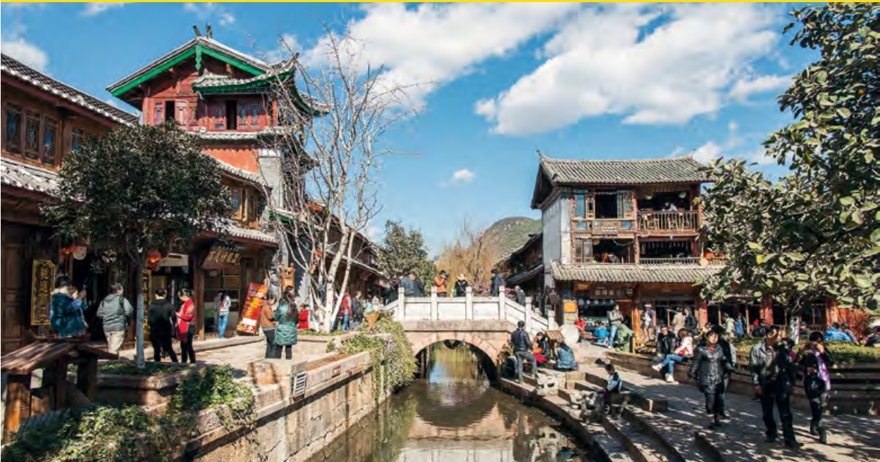
Lijiang old town, Yunnan, People's Republic of China.

Lijiang, an 800-year-old town in southwest China, is famous for its well-preserved historic streets, bridges and buildings, as well as for its intangible cultural heritage, including that of its minorities. In February 1996, a 7.0 magnitude earthquake caused 309 fatalities and damaged basic infrastructure, including 410,000 housing units. Yet effective cultural heritage conservation and timely recovery efforts led to the inscription of the Lijiang Old Town as a UNESCO World Heritage Site just one year later, in 1997.