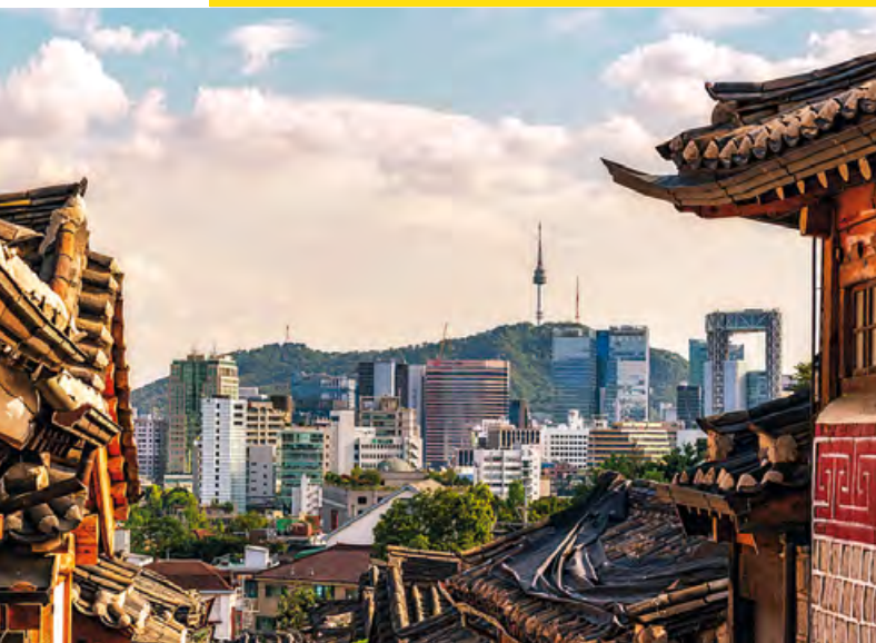
Seoul, Republic of Korea.

After a long focus on economic development following the Korean War, culture-based reconstruction leveraged tourism and local cultural recovery in Seoul to great effect. In the 1990s, four decades into recovery, Seoul's 600 th anniversary as a capital city provided the impetus for long-term efforts to restore its urban cultural and historical assets. Seoul's "6 th Centennial Celebration Project" included the restoration of old palaces and the development of historical and cultural trails along the old city walls. These efforts established a connection between old Seoul and contemporary Seoul through community-oriented projects that restored and enhanced cultural heritage. The historical and cultural trails surrounding the 600-year-old fortress walls were developed as a unique cultural tourism asset. The trails follow the path of the surrounding mountain ranges and serve to harmoniously connect the Old Walled City with the modern metropolis that is present day Seoul. For visitors and locals alike, this juxtaposition provides insight into Seoul's dynamic history and distinct geography as tourism revenue is invested into the local community. Visitors can enjoy traditional hospitality and ceremonial presentations while contributing to the local economy through tourist income. Through these culture-based projects, Seoul maintains a balance between modernity and tradition.