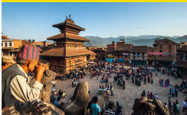
Bhaktapur Square, Kathmandu, Nepal.

The earthquakes of April 25 and May 12, 2015 were the worst to hit Nepal since 1934, when nearly 12,000 lives were lost. In 2015, 200 people died due to the collapse of the 19th century Dharhara Tower alone, a site that was also destroyed following the 1934 earthquake. Similarly, Kathmandu Durbar square has been subject to repeated destruction as a result of earthquakes.