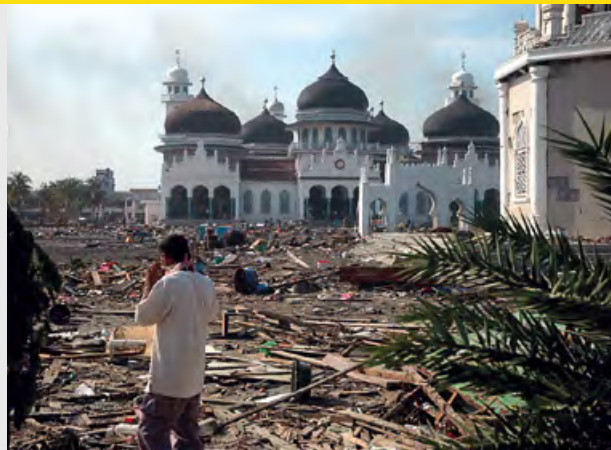
Baiturrahman Mosque view after earthquake and tsunami hit Banda Aceh City in December 2004.

“Unity in diversity” is a hallmark of Indonesia’s national identity and provided an entry point through which to provide information and solicit feedback on the reconstruction and peace processes. The World Bank and other development partners supported the Government of Indonesia in its communication and outreach efforts through a range of culturally informed interventions implemented by a variety of partners from both the UN system and civil society. For instance, reconstruction leaders collaborated with local theater groups to develop and perform new plays that promoted dialogue on Banda Aceh’s reconstruction and peacebuilding process. Local troupes were