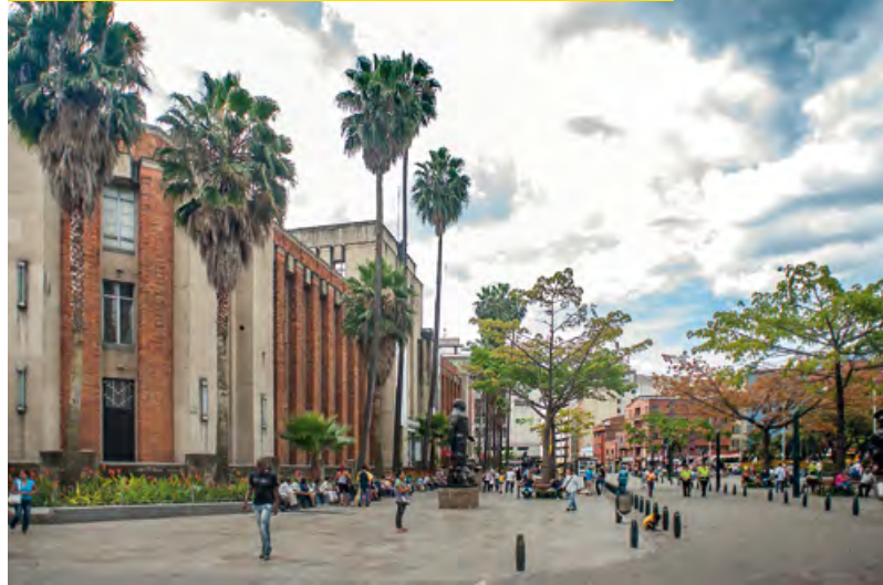
Comuna 13, Medellin, Colombia.

In Medellin, Colombia, which has transformed itself from a violent past to an exemplary city, participatory planning was a major component in post-crisis healing. The city established communal forums at the neighborhood level to produce a participatory diagnosis of reconstruction needs. Through this process, each community identified its own local problems and proposed its own solutions. Over 1,000 people and around 430 social organizations participated in the forums, which were spaces to debate local and city-wide issues.