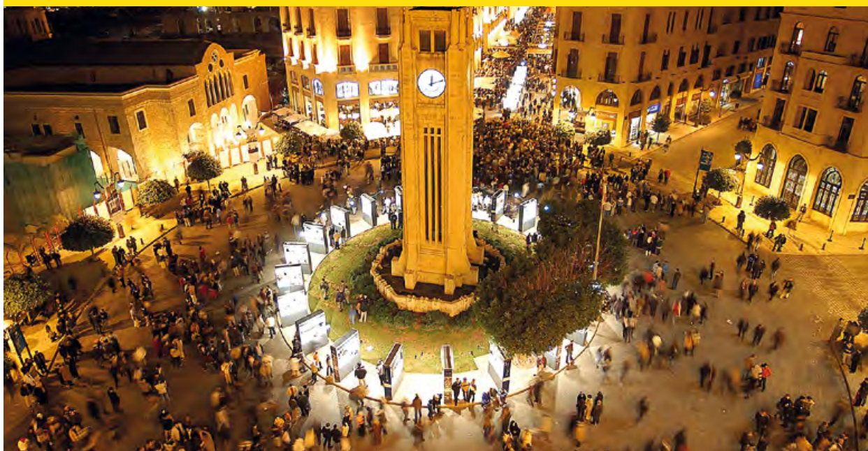
Nejmeh square, downtown Beirut, Lebanon.

Reconstruction after the Civil War (1975-1990) in Beirut followed two approaches. The first approach, which demonstrated mixed results, is that of the Beirut Central District (BCD). This example, which began after the war, is a cautionary tale of a rigid, centralized approach. Initially, limited oversight for BCD reconstruction allowed one set of stakeholders, in this case the private sector, to overtake the entire reconstruction and recovery process. Focusing mainly on economic development as the strategy for reconstruction of the BCD, Solidère, a private development company, was entrusted to rebuild the area. Solidère had initially prioritized attracting foreign investors to finance luxury offices and apartments within the setting of the city's iconic architecture and prioritized the transformation of old souks (markets) into commercial spaces devoid of community life. The model prioritized urban design over community involvement. Profit was prioritized over social inclusion and diversity.