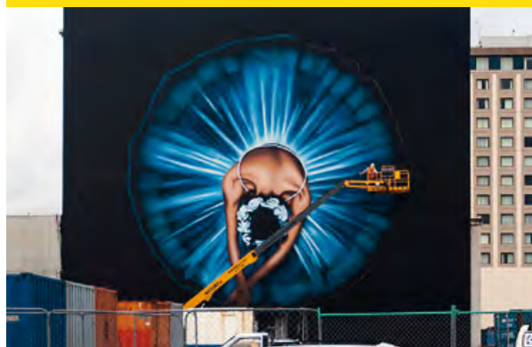
Ballerina being painted on the back of the Isaac Theater Royal, which was destroyed by the 2011 earthquake, Christchurch, New Zealand.

In September 2010 and February 2011, the city of Christchurch was hit by two devastating earthquakes. To generate community input, the city council launched an online platform about 10 weeks after the second earthquake. Residents submitted their ideas for the redevelopment process online. Within six weeks the platform had received 58,000 visits. A community expo, which drew more than 10,000 visitors, was organized to present the results of deliberations to the community.