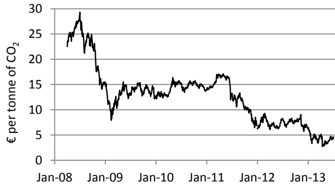
Figure 4: European carbon futures

13. The pace of technological change in the energy sector is dynamic. Costs of solar and onshore wind power have seen dramatic reductions in recent years, driven by technological advances, scale of deployment, and other factors. Global module prices of solar photovoltaic systems in 2011 U.S. dollars fell from $3.4 per watt in 2008 to $1.3 in 2011 (Barbose, Darghouth, and Wiser 2012). While levelized costs of electricity may suggest that these renewable resources, particularly wind, are