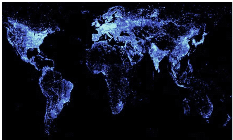
Figure 1: Nighttime satellite image of the world

5. Yet high costs of energy compromise the affordability of basic energy needs for households and the competitiveness of industry. Many countries in Sub-Saharan Africa face electricity costs as high as US$0.20–0.50 per kilowatt-hour, against a global average closer to US$0.10. Such high electricity costs become a barrier to further electrification. Similarly, a number of developing countries face high supply costs of petroleum products due to various bottlenecks and inefficiencies along the supply chain. These high energy costs, in turn, raise prices of goods and services for everyone and render businesses in tradable sectors uncompetitive. Stories abound of households struggling to pay for heating or reverting back to traditional biomass amidst rising fuel prices. To eliminate energy poverty, energy service delivery and consumption must be made more efficient. The service delivery must be supported by a sound pricing and tariff policy, backed by strengthened social protection. Where they are retained, subsidies need to be sharply targeted to the poor.