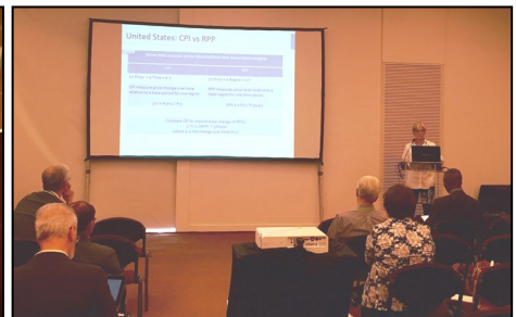
60 th ISI World Statistics Congress, July 30, 2015, Rio de Janeiro, Brazil