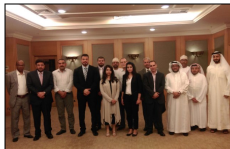
Sub-national PPP workshop, September 14-17, 2015, Abu Dhabi, UAE

Moreover, a sub-national PPP workshop took place in Abu Dhabi, United Arab Emirates on September 14-17, 2015 to monitor progress, finalize methodologies, provide training on the ICP tools, and set the future timeline for the regular production of sub-national PPPs in the United Arab Emirates. The final PPP results at the Emirate level are expected to be produced and released by the end of March 2016.