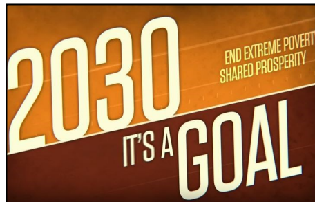
Still from the World Bank's "One Generation, Two Goals, 60 Seconds" video

The African Development Bank organized two additional sessions on "Measuring Economies using the ICP data: Regional perspectives" and "Purchasing Power Parity Concepts and Methodology: A Multifarious Outlook." China organized the fourth session entitled "Improving the ICP methodology in emerging economies," which marked the first time a country organized a session on the ICP in this forum. More information available online .