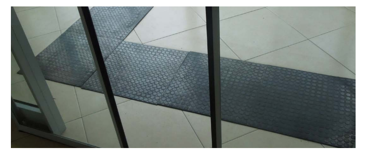
Tactile paving at the entrance of the CSC.

To this end, it provides services to rural areas; sensitizes staff to respond to the needs of the elderly and people with low levels of literacy regarding