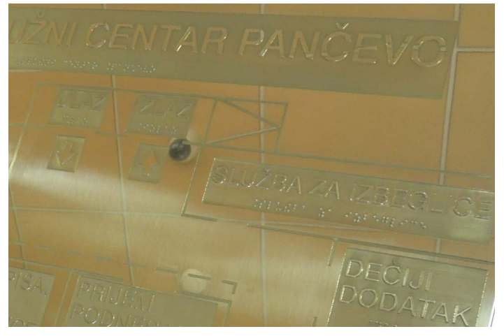
Orientation table in Braille donated by the Ministry of Labor, Employment, Veteran and Social Affairs

municipality by telephone, email, or text message regarding a problem, and they are guaranteed a response within 48 hours, detailing the manner and time by which the problem will be solved. This system is present in several municipalities in Serbia (see box 5).