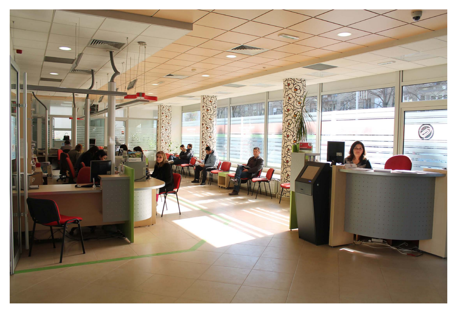
The citizen service center's welcoming booth with an e-ticketing system, waiting area, and service counters.